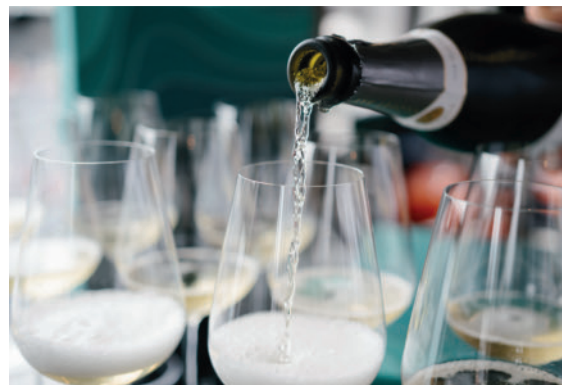
Clockwise See Auckland from above by helicopter; aerial view of Somewhere; Atelier Nash's private wine experience; harbor views from the Park Hyatt Auckland